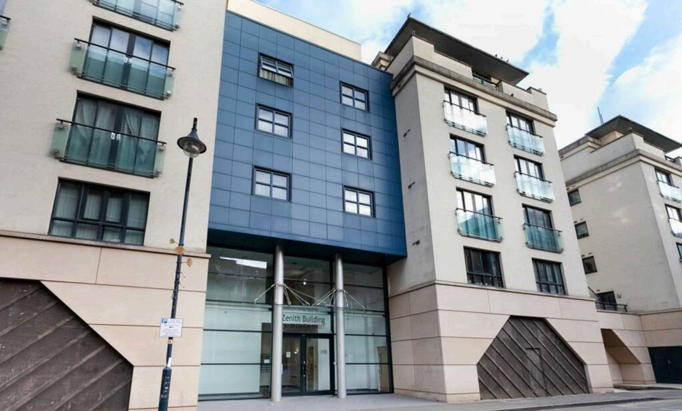
Apt 6, The Zenith Building, 26 Colton Street £175,000