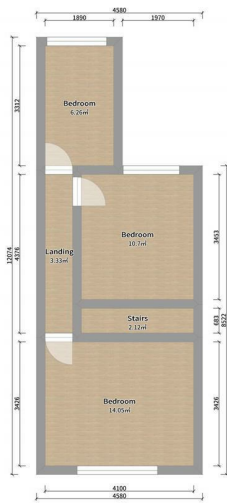
Milner Road First Floor