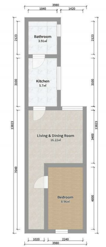
Milner Road Ground Floor