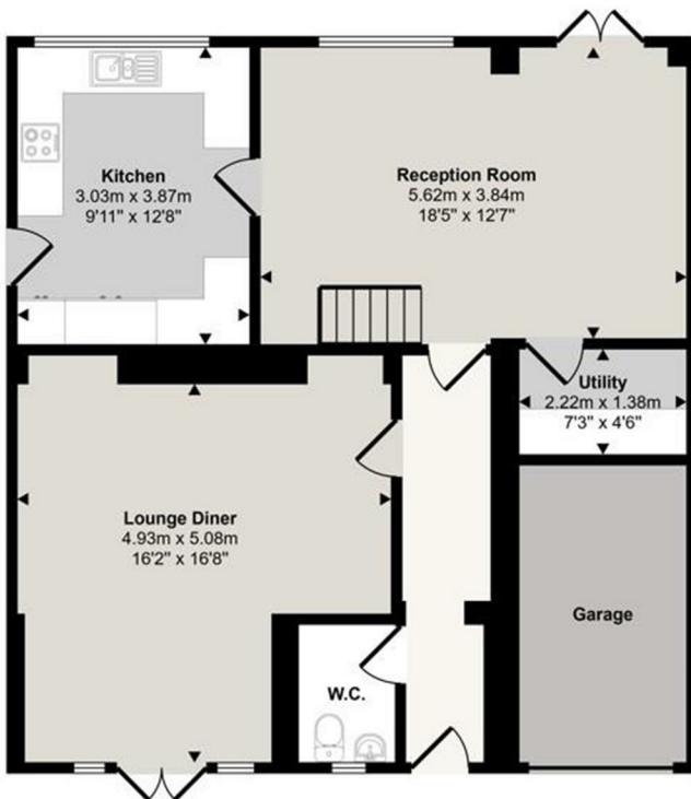
Ground Floor Approx 84 sq m / 900 sq ft

Approx Gross Internal Area 146 sq m / 1575 sq ft