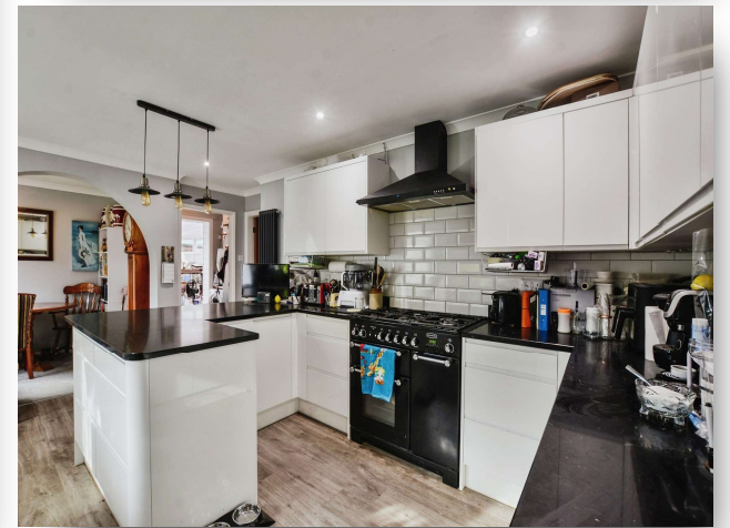
The Hurst, Skegness PE25 1HP