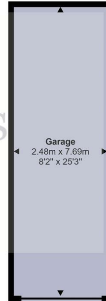
Garage Approx 19 sq m / 205 sq ft

This floorplan is only for illustrative purposes and is not to scale. Measurements of rooms, doors, windows, and any items are approximate and no responsibility is taken for any error, omission or mis-statement. Icons of items such as bathroom suites are representations only and may not look like the real items. Made with Made Snappy 360.