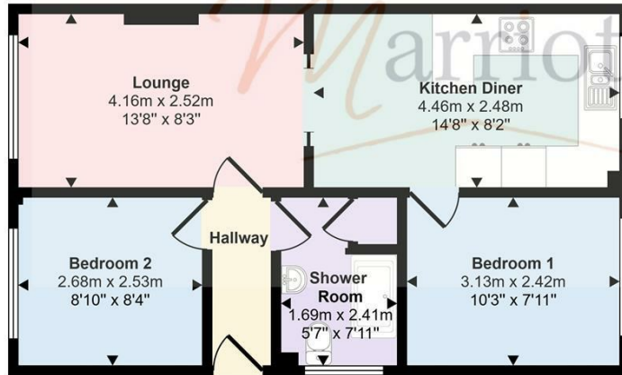
Floorplan Approx 45 sq m / 485 sq ft