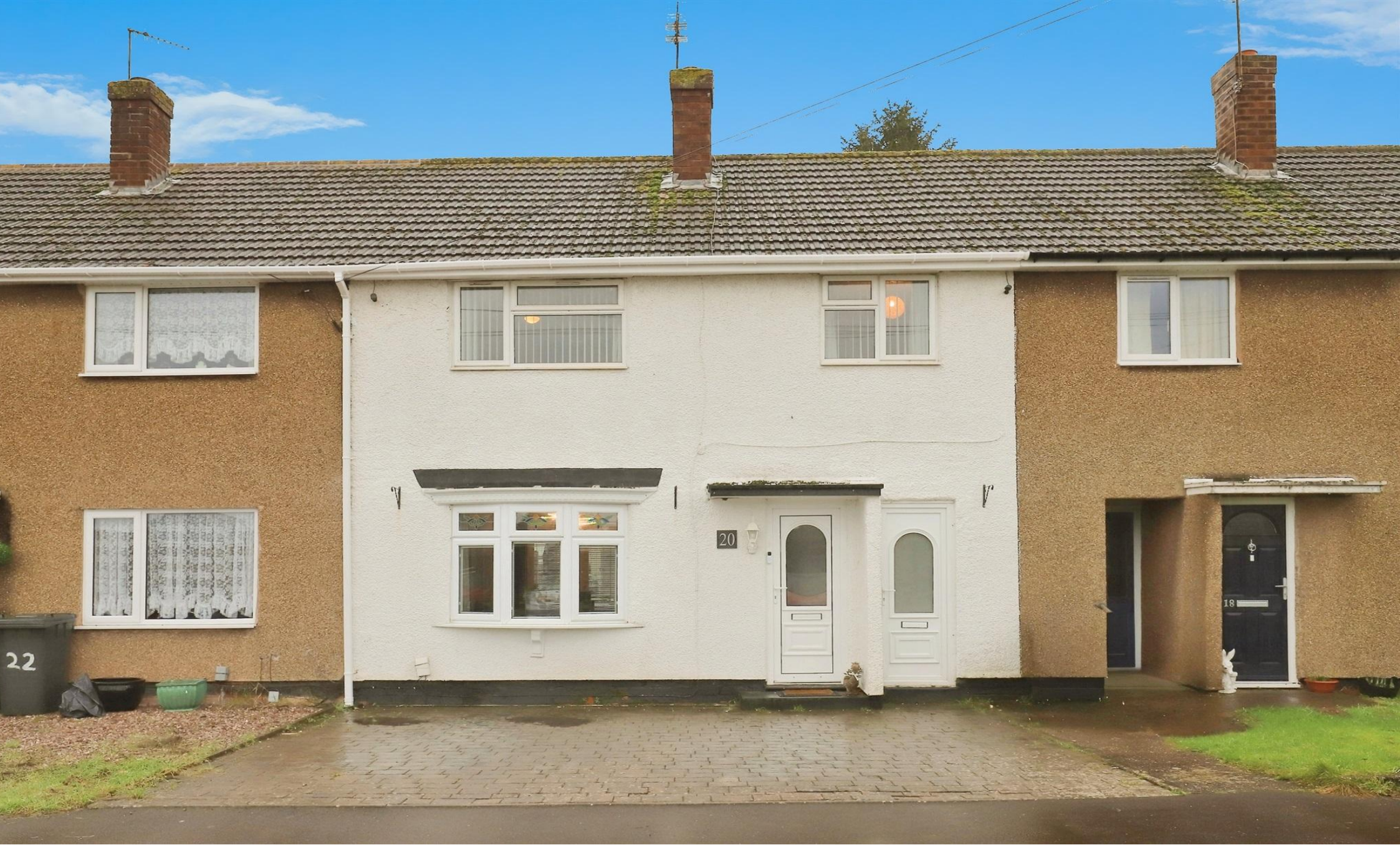
Dunclent Crescent, Kidderminster DY10 3EE