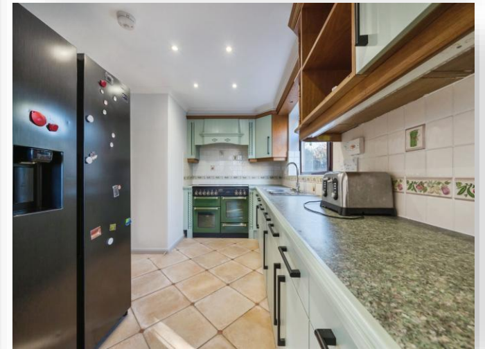
Adur Close, West End, Southampton SO18 3NH