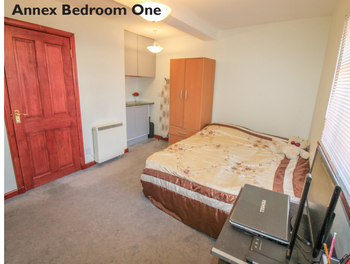
Annex Bedroom One