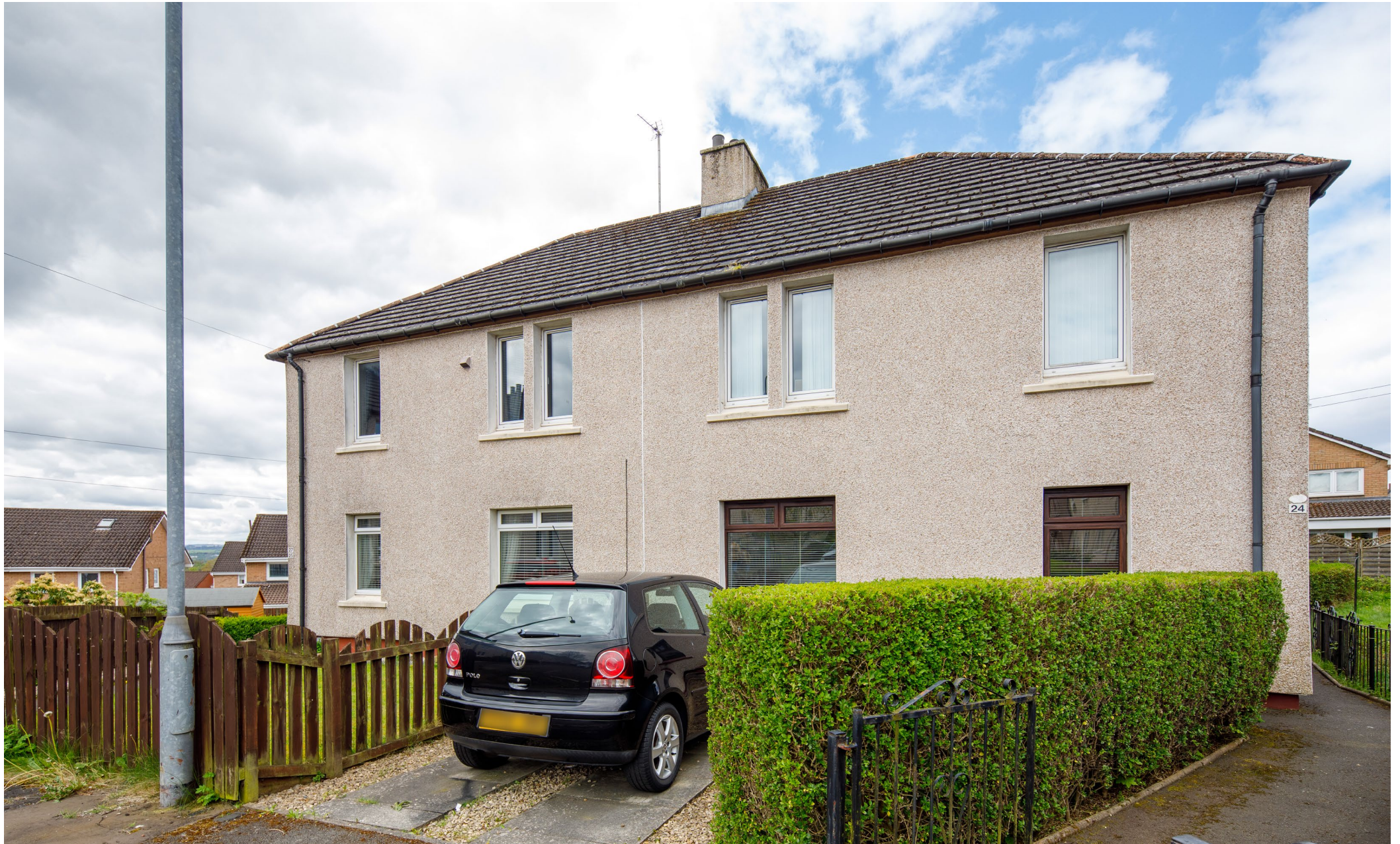
24 Ellismuir Place, Baillieston, G69 7HR www.nicolestateagents.co.uk