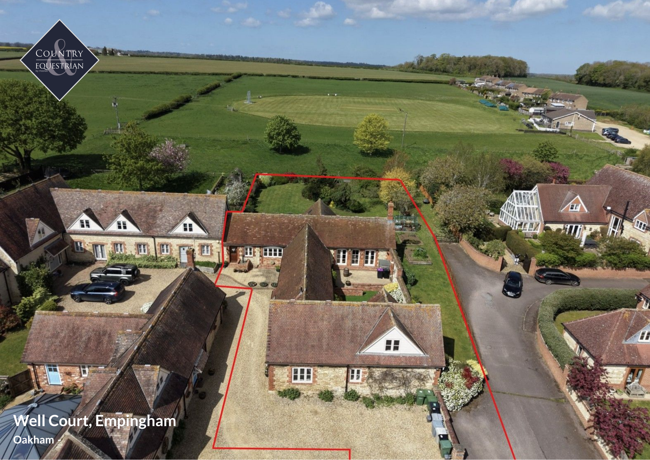
Well Court, Empingham Oakham -