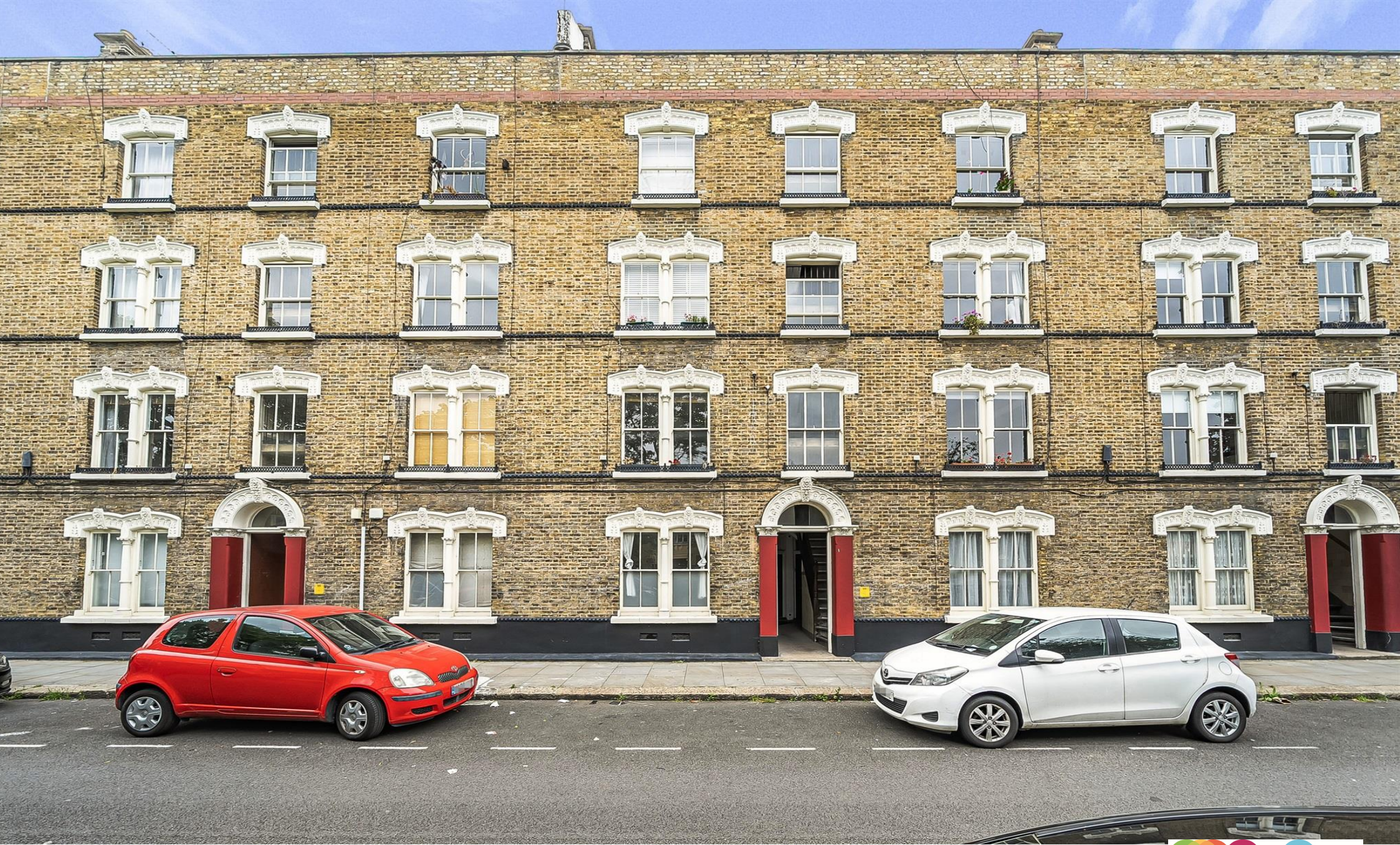
Amelia Street, London SE17