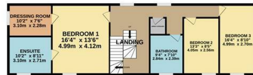
1ST FLOOR 952 sq.ft. (88.4 sq.m.) approx.