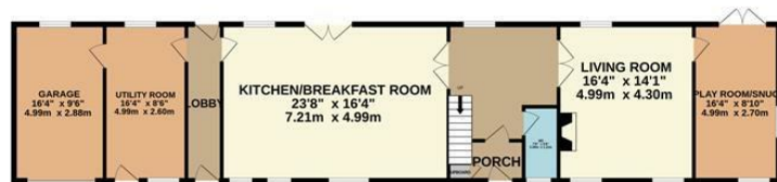
GROUND FLOOR 1300 sq.ft. (120.8 sq.m.) approx.