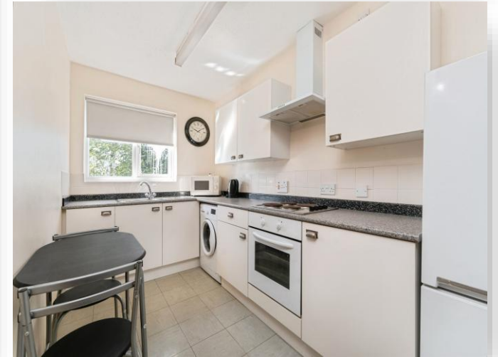
Hansart Court, Robingoodfellows Lane, March PE15 8JY