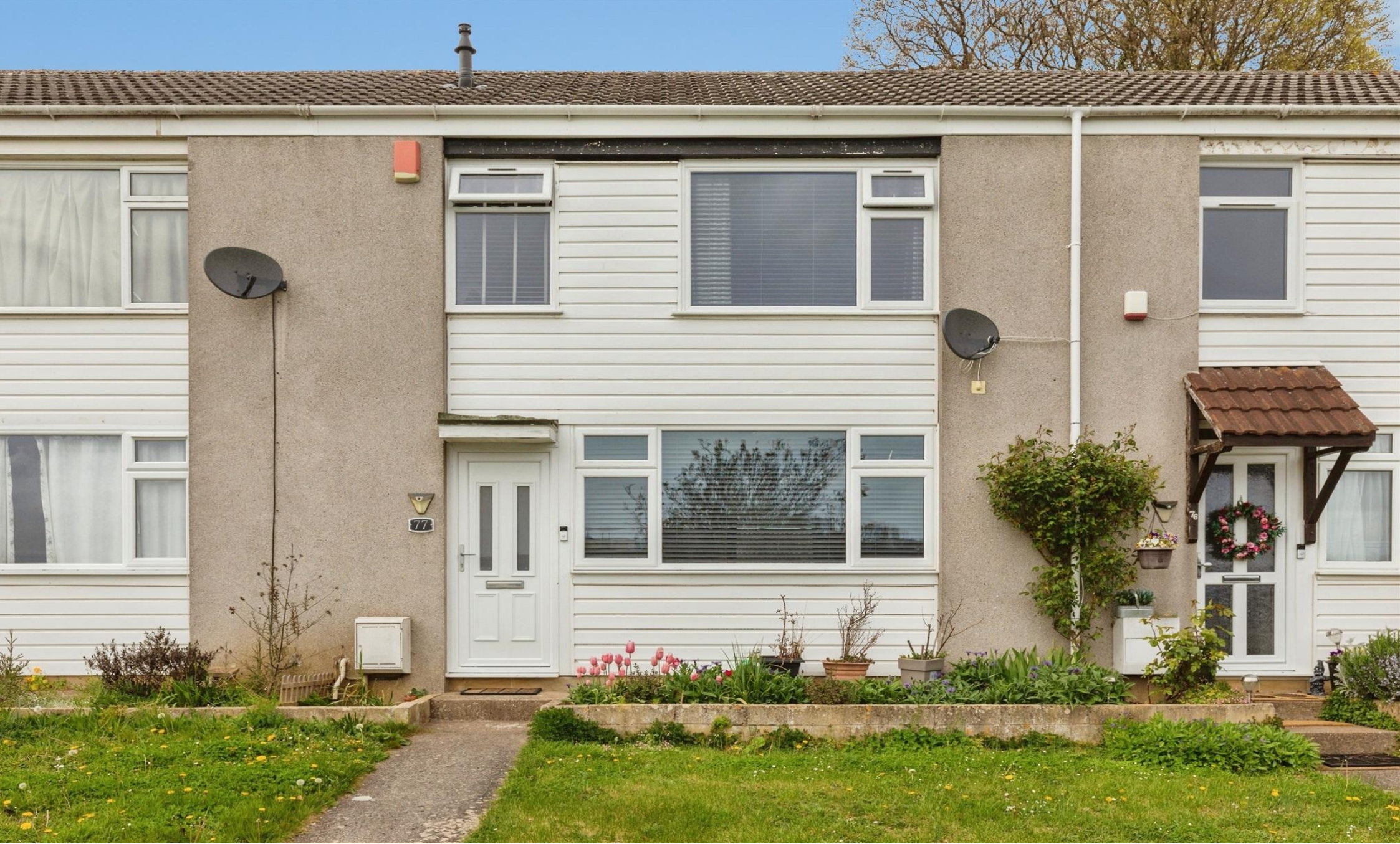
Redland Park, Bath BA2 1SH