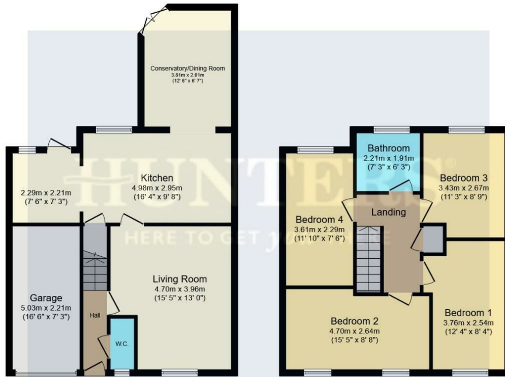
Ground Floor Floor area 65.0 sq.m. (700 sq.ft.) First Floor Floor area 53.9 sq.m. (580 sq.ft.)

Total floor area: 118.9 sq.m. (1,280 sq.ft.)