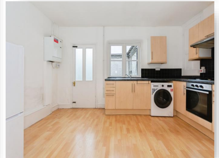
Old Church Road, Harborne Birmingham B17 0BB