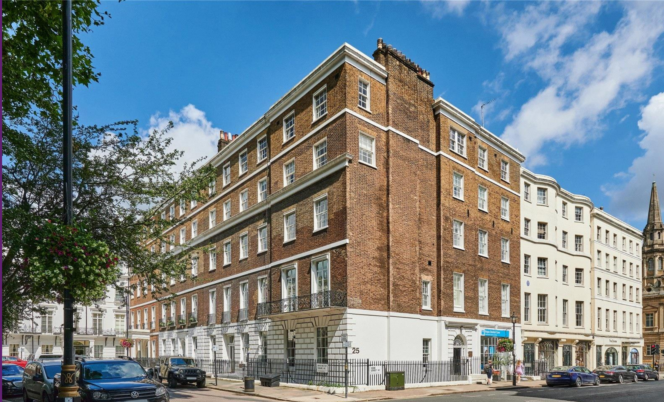
Manchester Square Marylebone, W1U