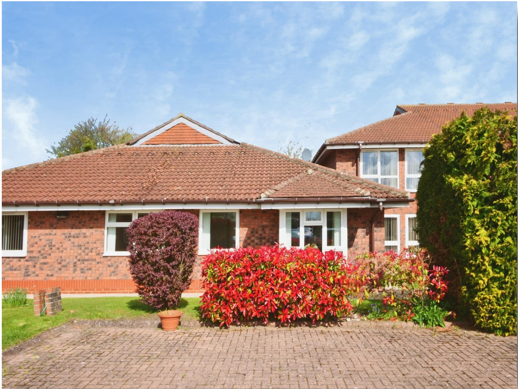
St Marys Mews, Wigginton York YO32 2SE