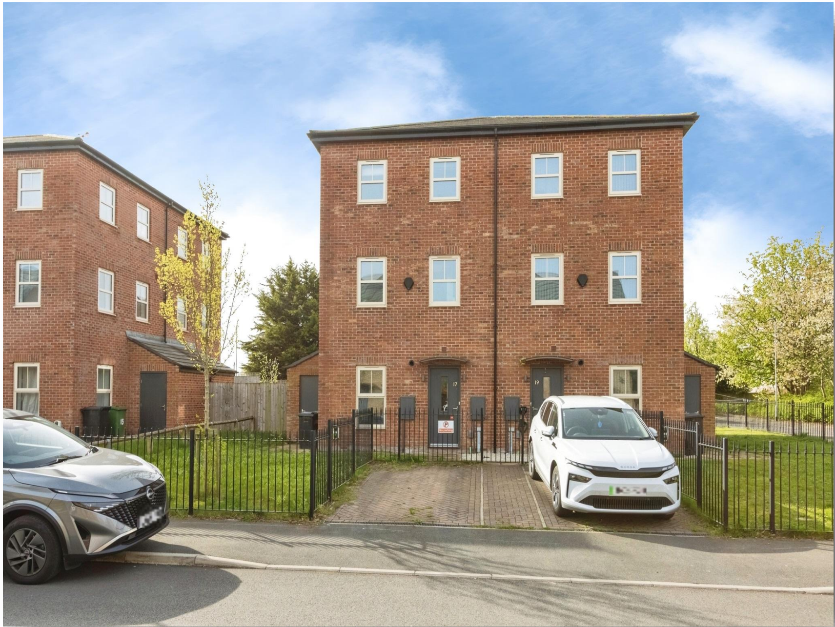
Cardwell Road, Leeds LS14 1FL