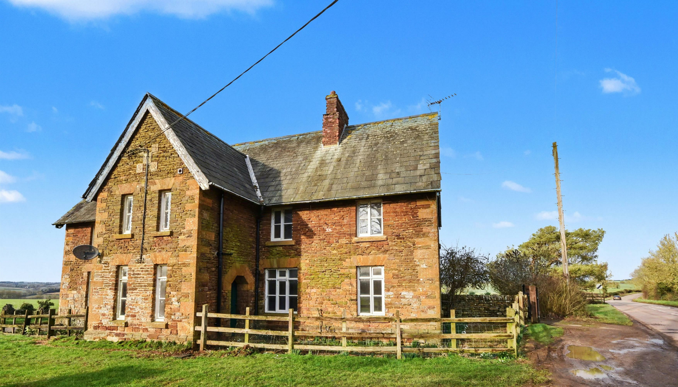
West Townsend Cottage Rothwell Road Northampton, NN6 9HJ