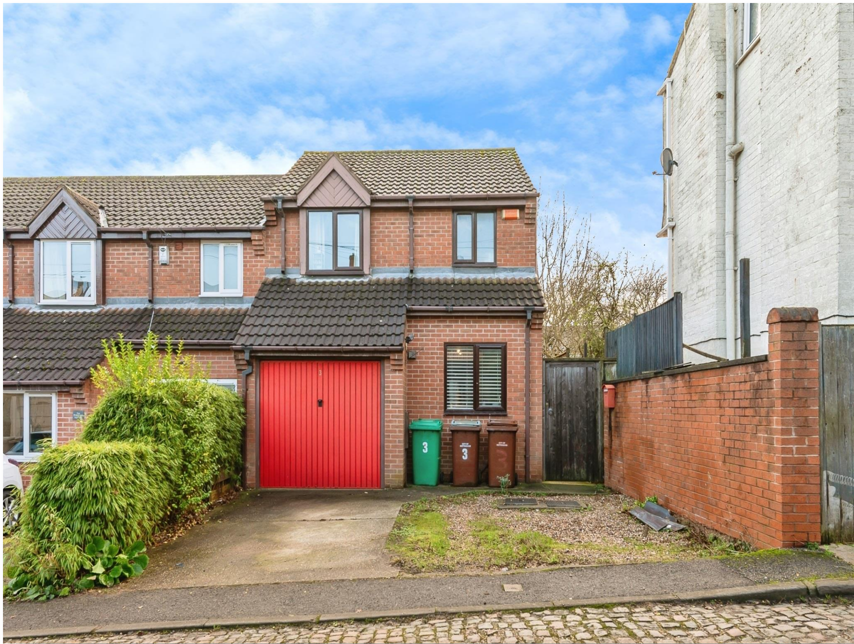
Berry Court Holly Gardens, Nottingham NG3 2PB