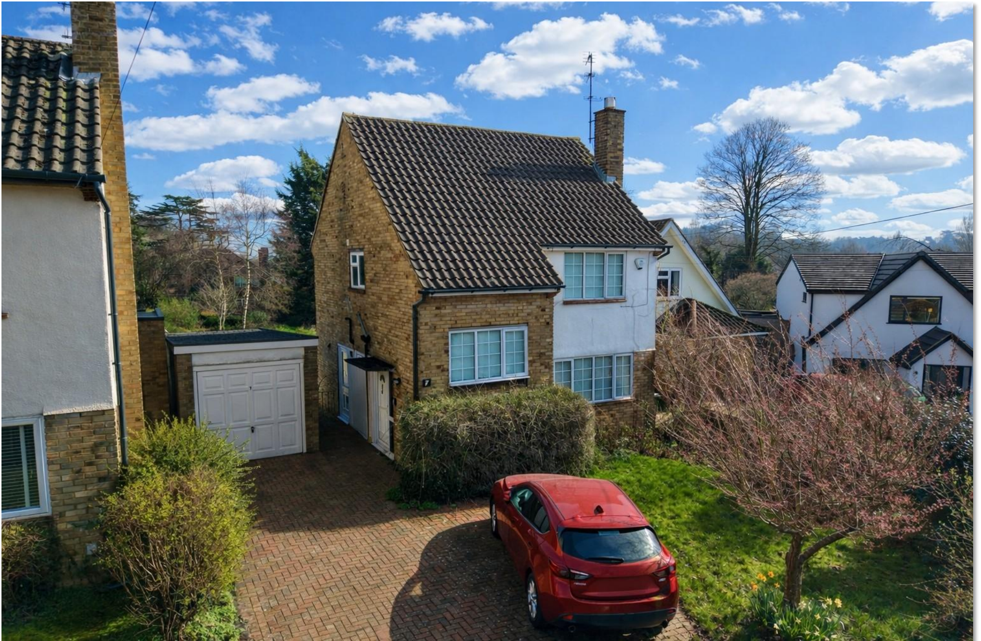
South Park Gardens, Berkhamsted HP4 1JA