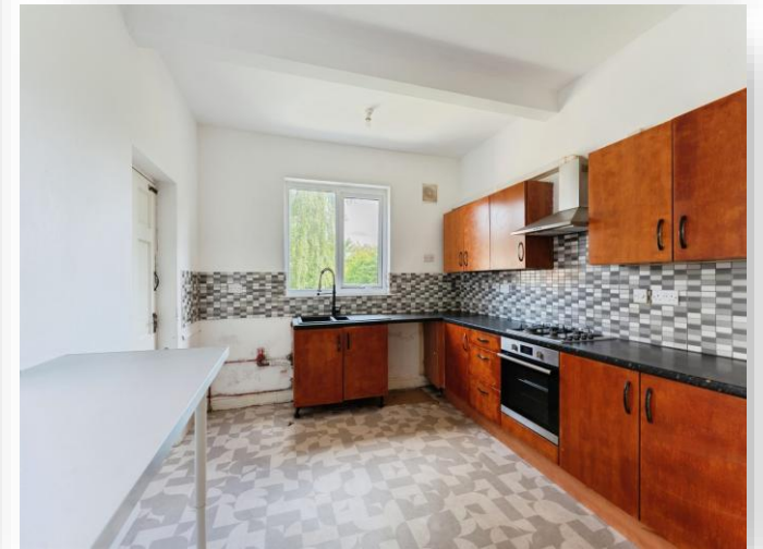
Highfield Road, Rock Ferry, Birkenhead, CH42 2BX