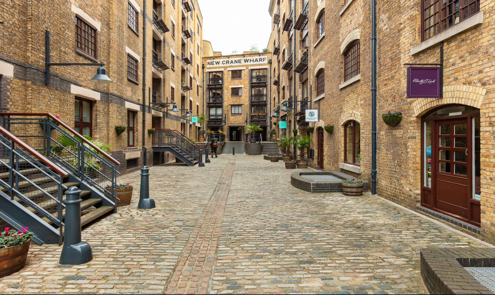
New Crane Wharf, 14 New Crane Place, London E1W 3TU