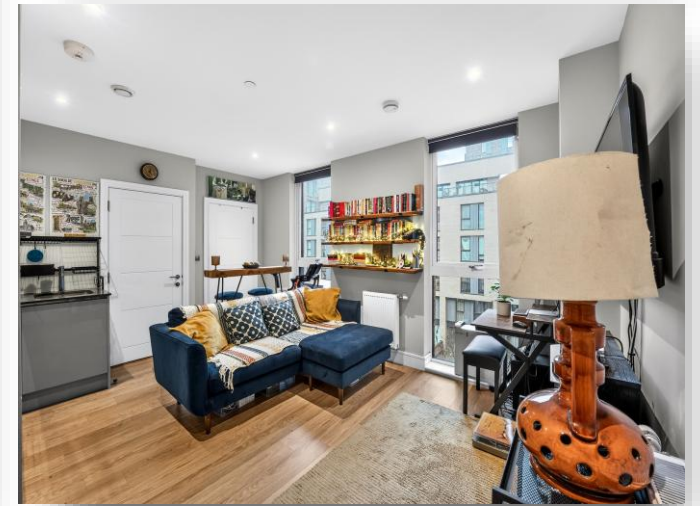
Mauger Heights, Summerstown, London SW17 0GZ