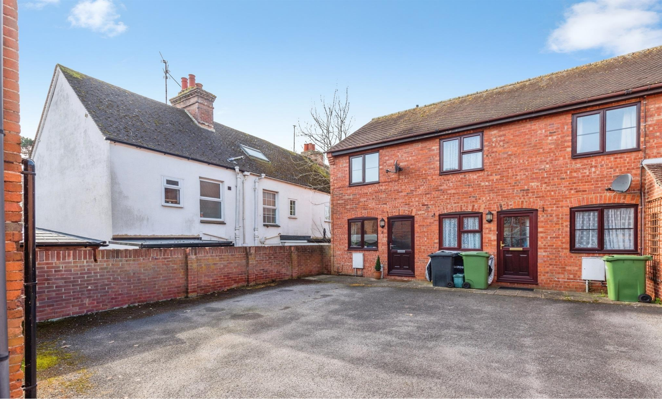
Bath Court, Bath Street, Abingdon, OX14 1EE