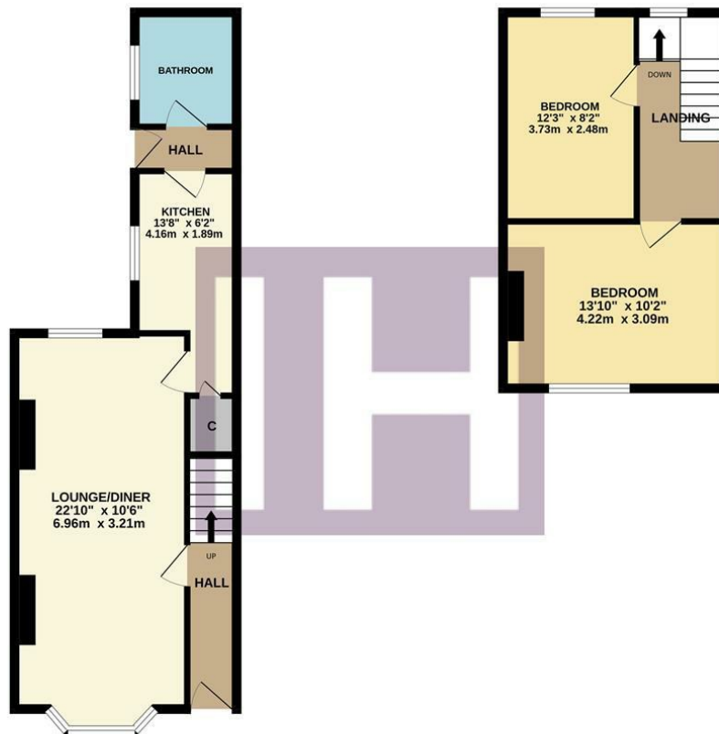
TOTAL FLOOR AREA: 733 sq.ft. (68.1 sq.m.) approx.

Whilst every attempt has been made to ensure the accuracy of the floorplan contained here, measurements of doors, windows, rooms and any other items are approximate and no responsibility is taken for any error, omission or mis-statement. This plan is for illustrative purposes only and should be used as such by any prospective purchaser. The services, systems and appliances shown have not been tested and no guarantee as to their operability or efficiency can be given. Made with Memopix ©2025.