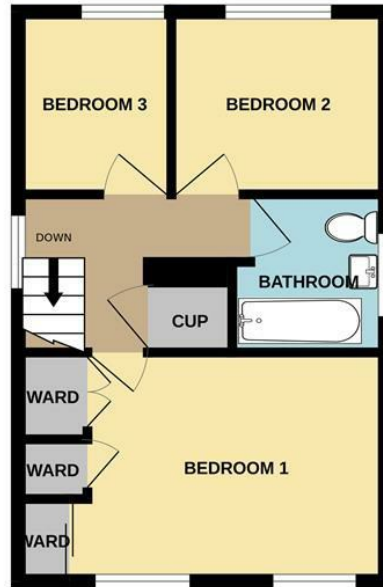
1ST FLOOR 330 sq.ft. (30.7 sq.m.) approx.