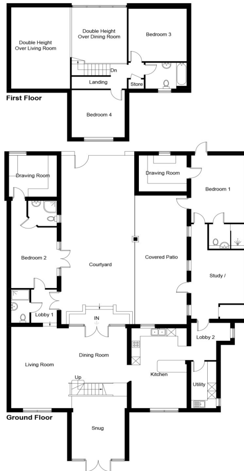
Illustration for identification purposes only, measurements are approximate, not to scale. Fourlabs.co © (ID1282304)

Viewing Strictly by appointment with the agent.