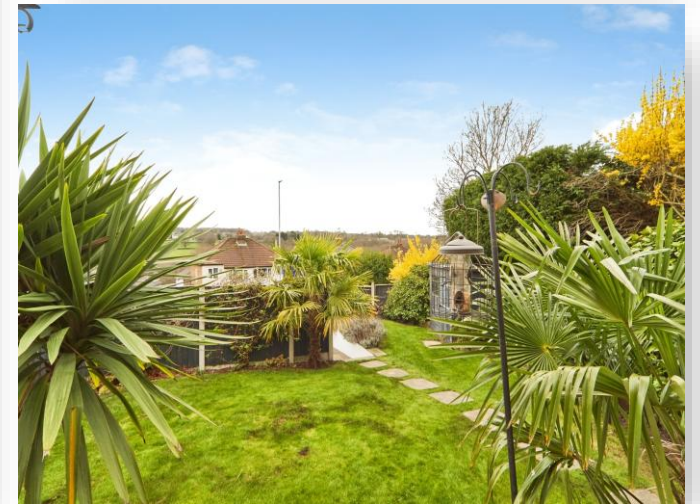
Tinshill Road, Leeds LS16 7LE