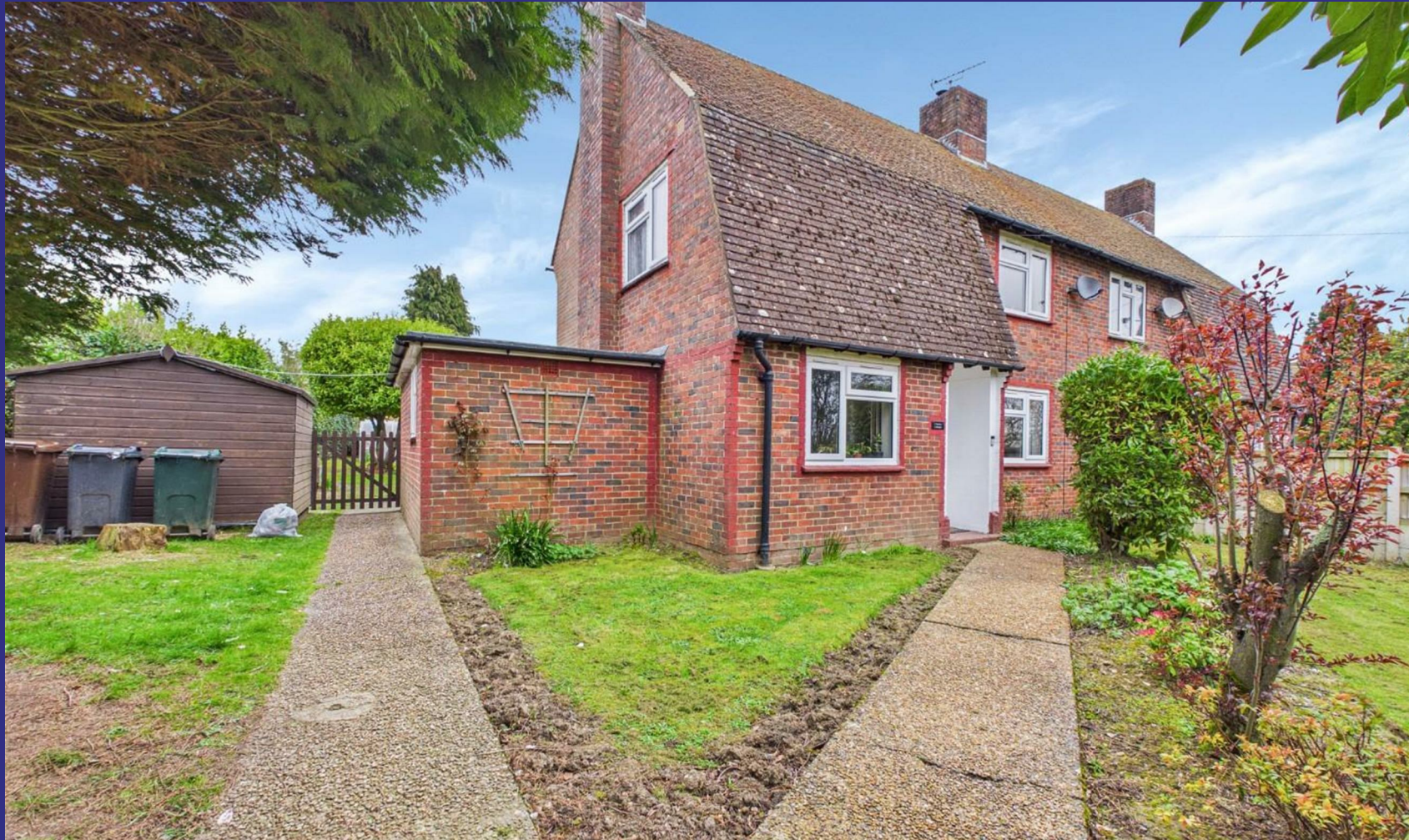
Pilgrims Way Ashford