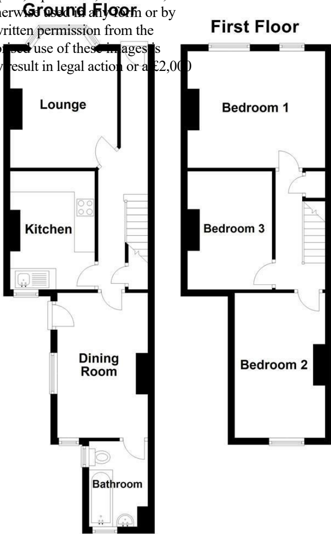
Not to scale. For illustrative purposes only