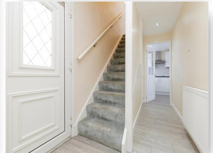
Durham Street, HARTLEPOOL TS24 0HE