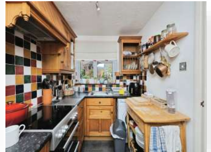
Olive Avenue, Newton Flotman Norwich NR15 1PF