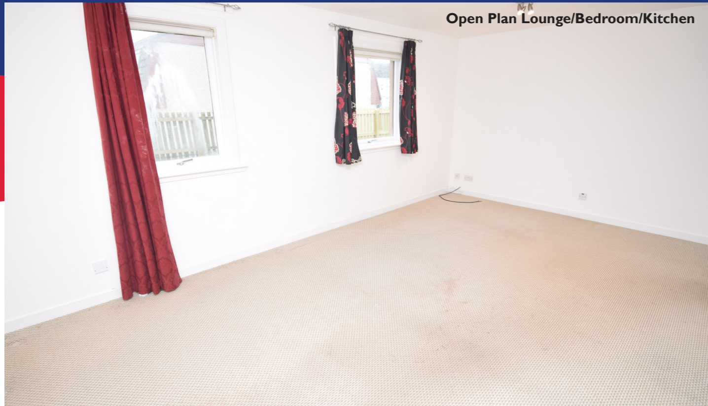
Open Plan Lounge/Bedroom/Kitchen