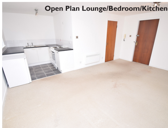
Open Plan Lounge/Bedroom/Kitchen

Hilton Crescent is a popular and well-established residential area of Inverness, valued for its convenience and strong community feel. A wide range of everyday amenities can be found at the nearby Balloan Shopping Area, including a pharmacy, convenience store, lounge bar/diner, fast food outlets, hairdressers and nail salon. Excellent transport links are provided by the nearby Southern Distributor Road, offering swift access throughout the city and to key employment centres such as Raigmore Hospital, Police Headquarters, Beechwood Business Park, LifeScan and Bannatyne Health Club. Additional retail and leisure facilities are available at the nearby Inshes Shopping Centre. Inverness city offers an excellent quality of life with a wide range of cultural, leisure and commercial amenities, together with direct road, rail and air links to major cities throughout the UK.