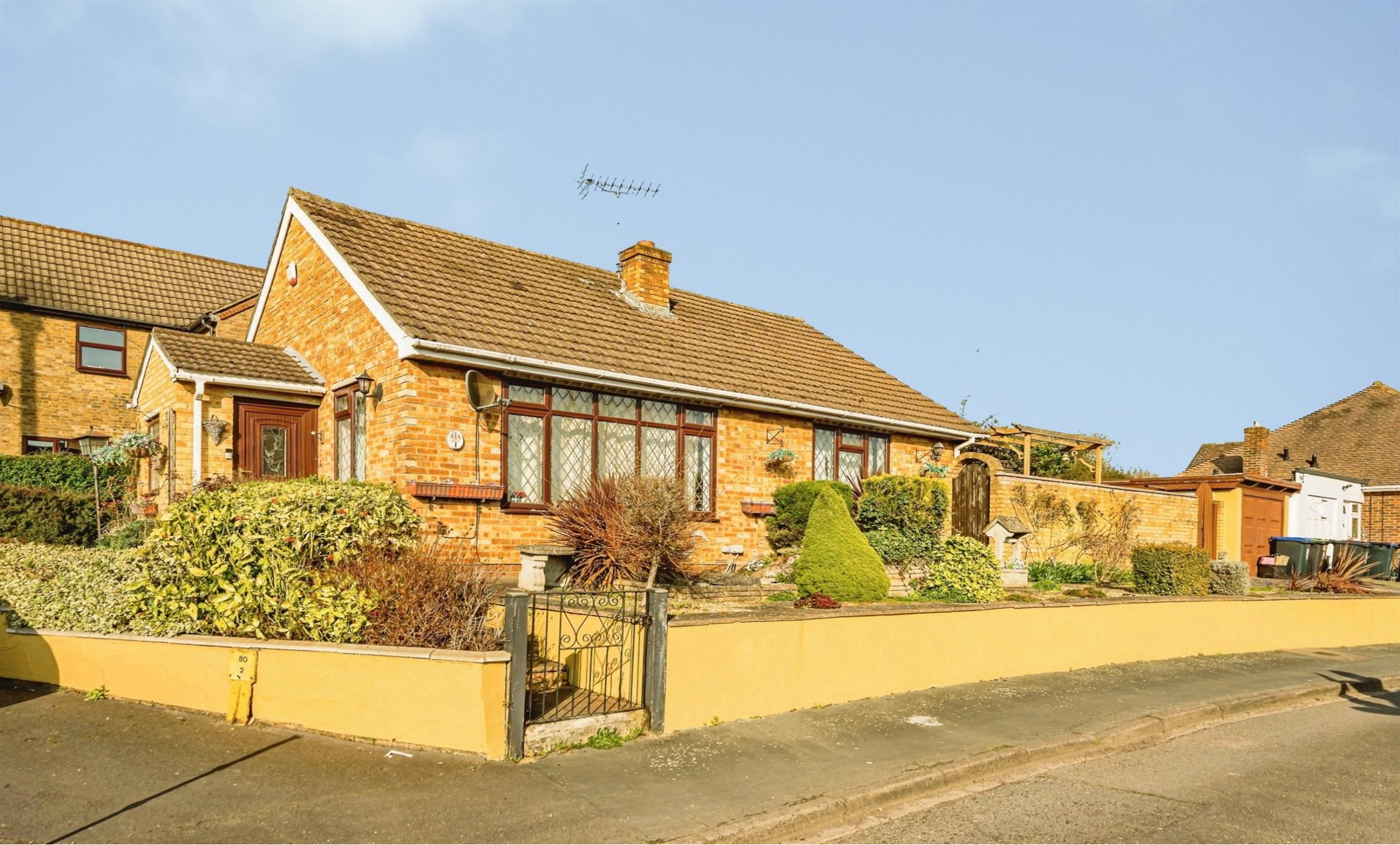
Harkness Road, Burnham Village SL1 7BL