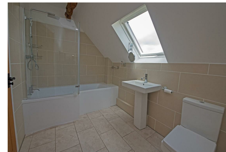
BATHROOM 3.38m x 1.91m (11'1" x 6'3")

A well appointed main bathroom with a white three piece suite comprising panelled bath with shower and screen, pedestal wash basin and low flush wc. Attractive part tiled walls, tiled floor, towel radiator, exposed original purlin, recessed ceiling lighting, extractor fan and Velux double glazed roof light with views.