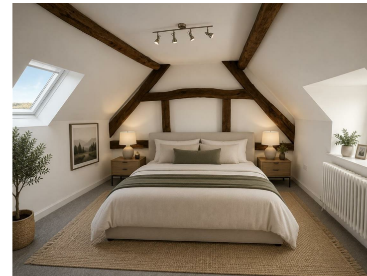
BEDROOM 2 4.34m x 3.66m (14'2" x 12'0")

A double sized room with original exposed purlins and 'A' frame timbers, double glazed dormer window to the rear and further double glazed roof light to the front aspect. Traditional style radiator.