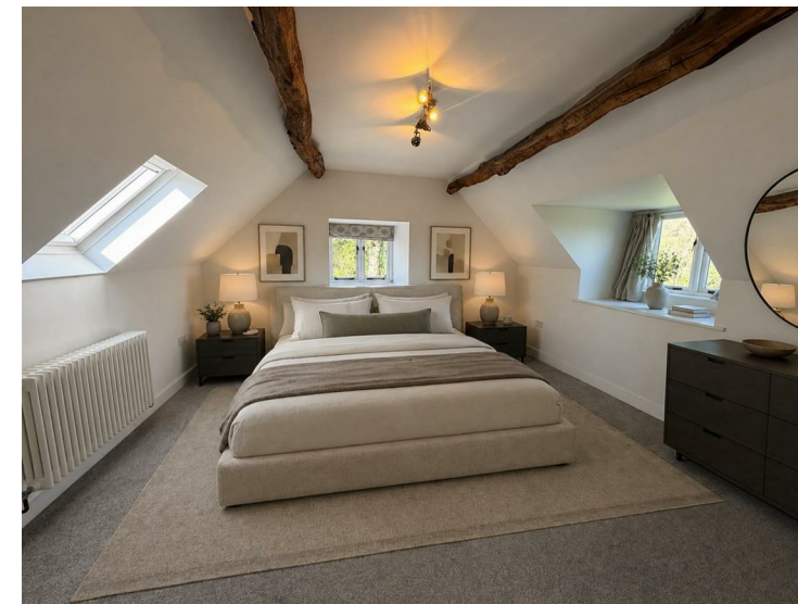
BEDROOM ONE 4.39m x 4.34m (14'4" x 14'2")

A spacious and well lit room with deep sill double glazed windows to the side and front elevations with superb views and further double glazed Velux window to the rear. Shaped ceiling with exposed purlins and traditional style radiator.