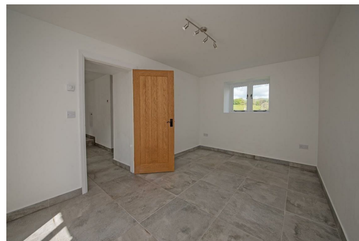
STUDY 4.32m x 2.74m (14'2" x 8'11")

Full length double glazed window to the rear elevation and further double glazed window to the front with rural aspect. Tiled floor.