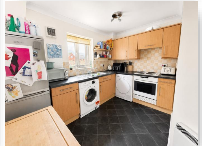
Heritage Way, Gosport, PO12 4FG