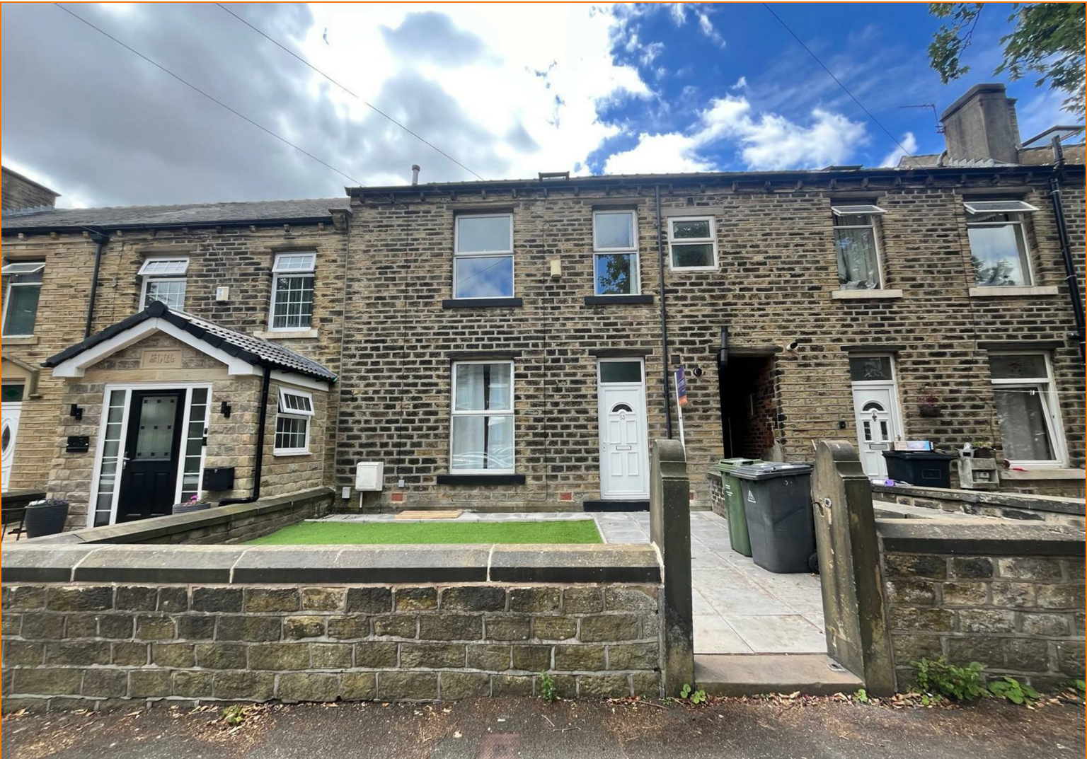
Beech Street Huddersfield, HD1 4JS