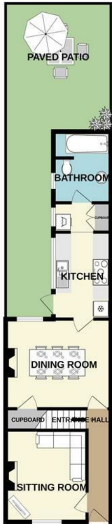
GROUND FLOOR 494 sq.ft. (45.9 sq.m.) approx.