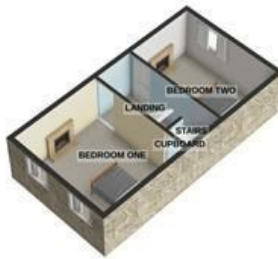
2ND FLOOR 277 sq. ft. (25.7 sq.m.) approx.