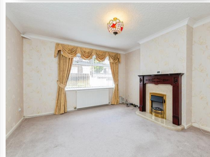
Spearman Walk, Hartlepool, TS27 3PB