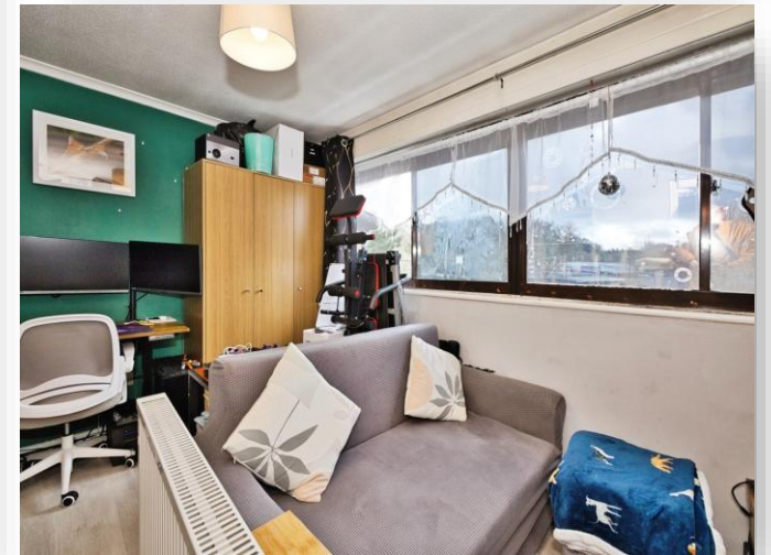
Ivel Court, YEOVIL, BA21 4HX