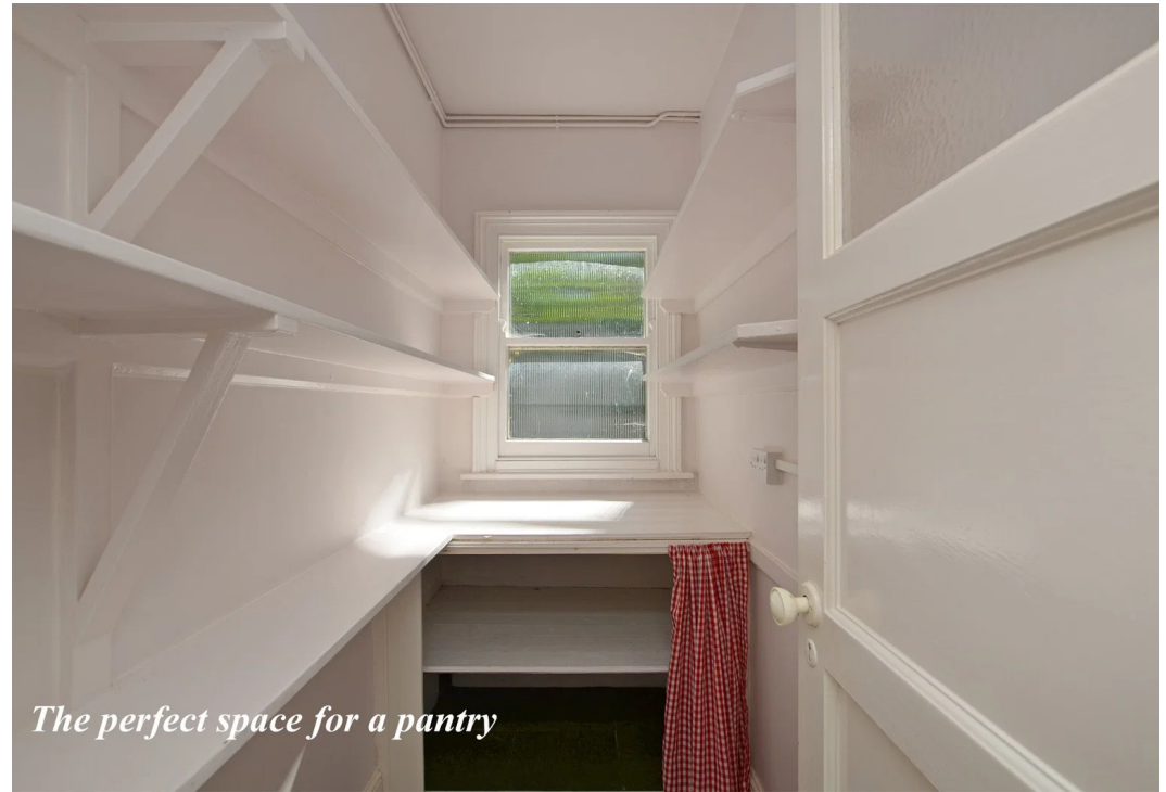
The perfect space for a pantry