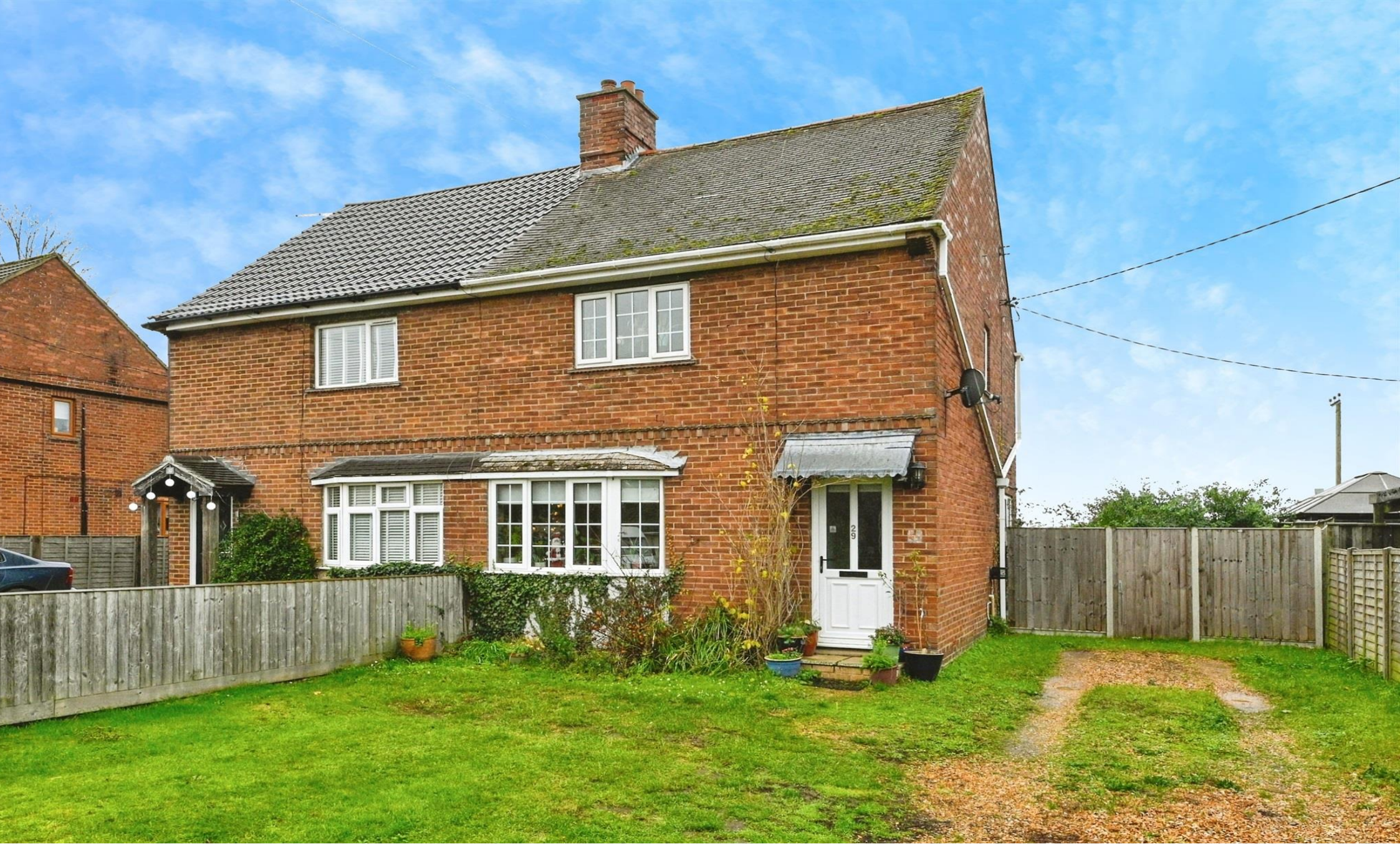
St. Marys Terrace, Middleton, KING'S LYNN, PE32 1RD