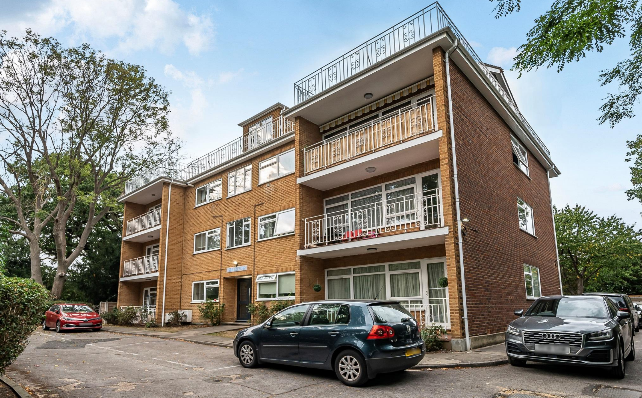
Halcyon House, Private Road, Enfield, EN1 2EJ