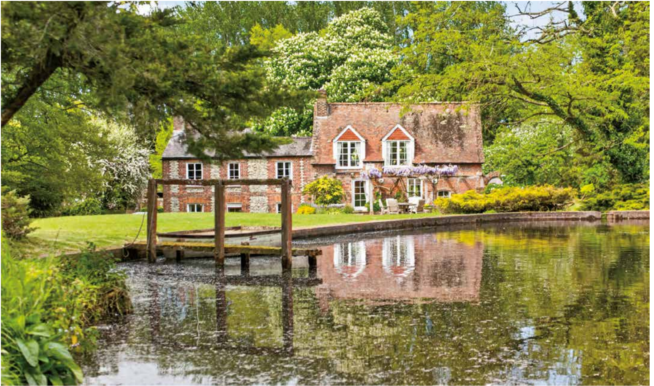
Watlington Mill Cuxham Road | Watlington | Oxfordshire | OX49 5NA