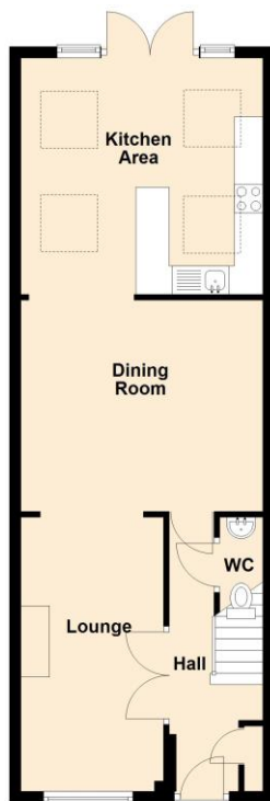
Ground Floor Approx. 54.8 sq. metres (589.5 sq. feet)

To check broadband speeds and mobile coverage for this property please visit: https://www.ofcom.org.uk/phones-telecoms-and-internet/advice-for-consumers/advice/ofcom-checker and enter postcode WR10 1EQ