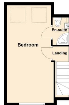
Top Floor Approx. 25.5 sq. metres (274.0 sq. feet)

Total area: approx. 117.3 sq. metres (1262.6 sq. feet)