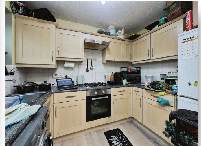
Geneva Walk, Toftwood, Dereham, NR19 1XT