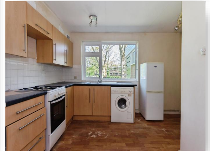
Wilsford Green Oak Hill Drive, Birmingham B15 3UG