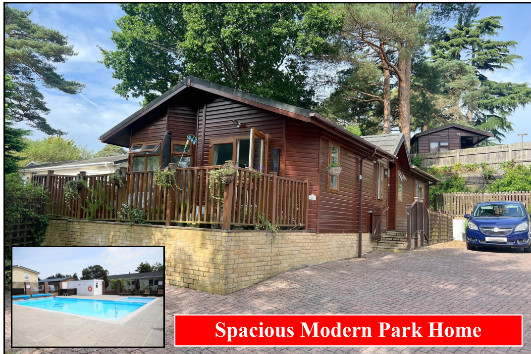
Spacious Modern Park Home

26 Tall Trees Park, Matchams Lane, Christchurch, Dorset. BH23 6TT